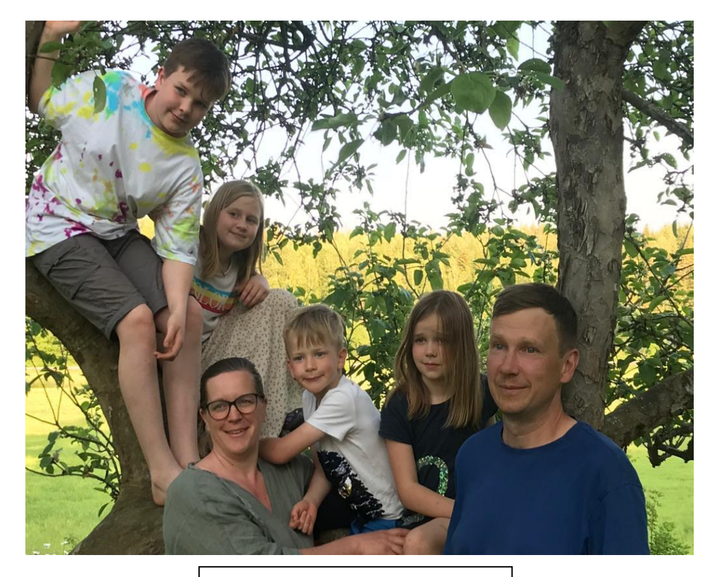
The Sorsamo Family in Finland

The summer appeal is open for 2023 and will go towards the support of our three missionaries.