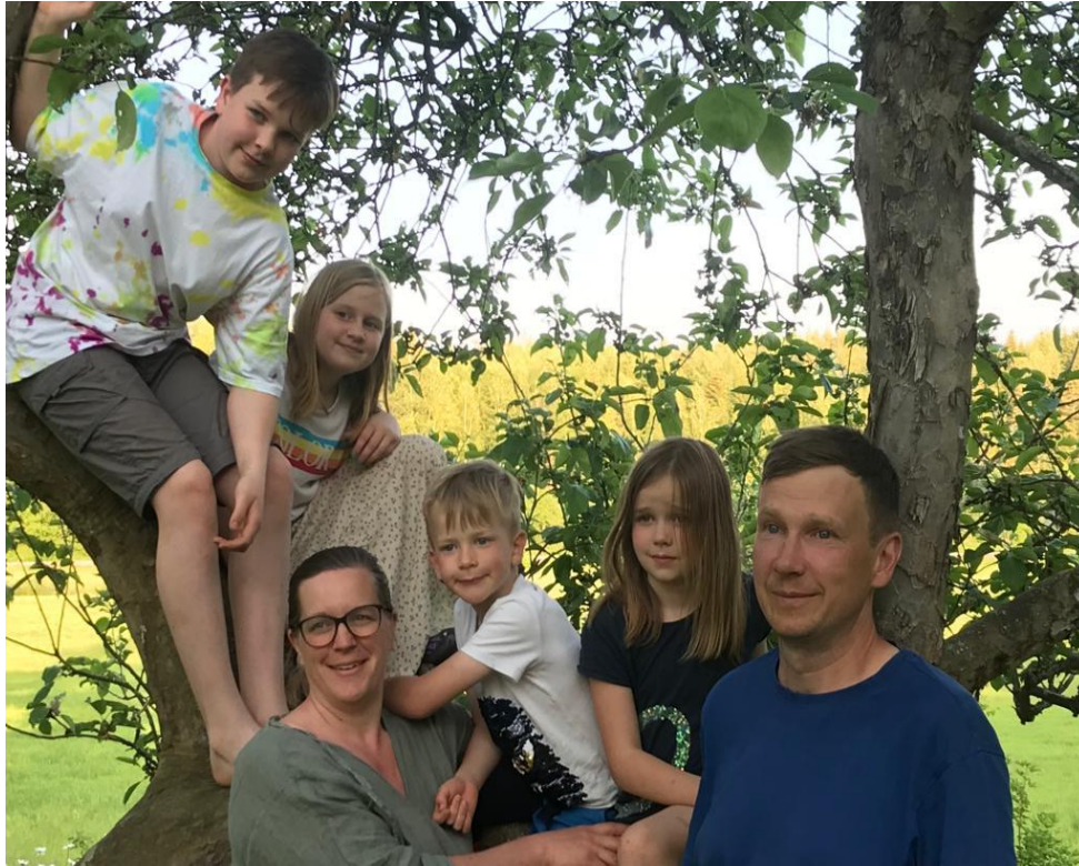
The Sorsamo Family in Finland

The Summer Appeal currently stands at £7624 and will go towards the support of our three missionaries.